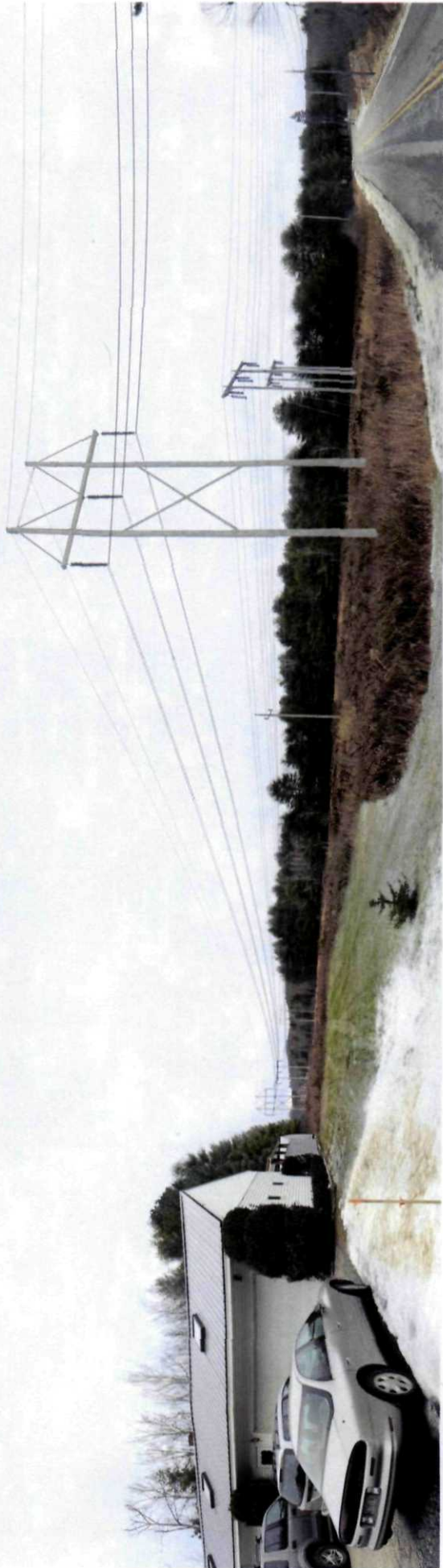
Photosimulated view of proposed Segment 17, which includes two existing 115 kV transmission lines and one new 34.5 kV transmission line, and an existing 34.5 kV transmission line.