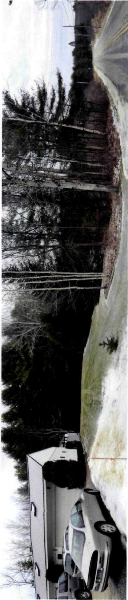
Existing panoramic view looking north to southeast in front of the Parent Property on Old Webster Road in Lewiston, ME.